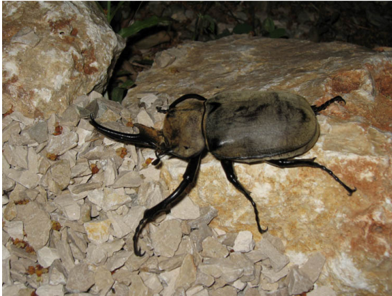
Photo 3.1 A rhinoceros beetle ( Dynastes sp. ) in Nosara, Costa Rica

However, the details of conservation planning and the emphasis, nature, and level of detail for the various components of the strategy may be quite different.