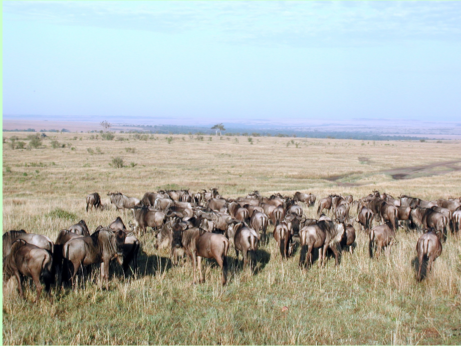
Photo 7.2 Wildebeest ( Connocchaetes taurinus ) migration in the Masai Mara, Kenya

Like many other aspects of strategic planning for species conservation, threat analyses are likely to be most useful when conducted by interdisciplinary teams of stakeholders with a diverse array of expertise and experience. This should ensure that all of the key threats are identified by the analysis.