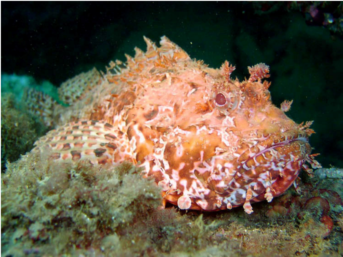
A scorpion fish (Scorpaenidae) in the Mediterranean sea, near Escala, Spain