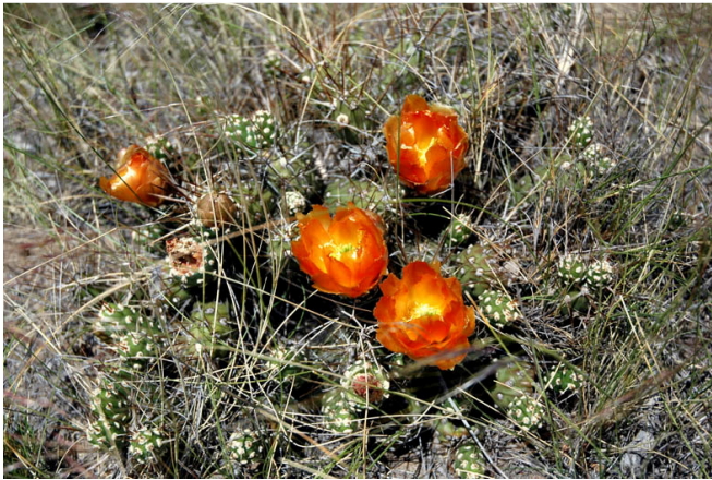
Photo 8.1 A cactus flower on Peninsula Valdès, Argentina

Within the framework of the SCS, Actions fall below Objectives (see Figure 2.1). However, because Objectives can be rather broad in their scope, whereas Actions are often most useful if very specifically defined, it is helpful to group Actions under a number of Objective Targets associated with each Objective (see Table 8.1). Each of the Actions proposed should be necessary to achieve the Objective Target with which it is associated. Additionally, the Actions listed under an Objective Target should, together, be