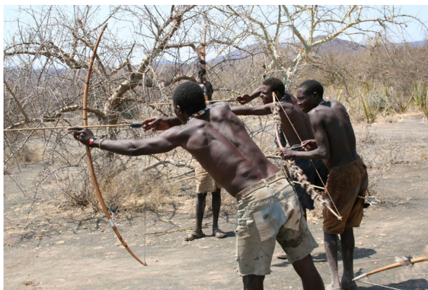
Photo 5.1 Hadzabe Bushmen hunting, Lake Eyasi region, Tanzania

This subsection answers the question: Why save the species? It should summarise the values of the species to people, including ecosystem services connected to the species (such as pollination and seed dispersal), human consumptive (for example, food and decoration) and non-consumptive (for example, tourism) uses of the species, and important cultural and spiritual values (such as cultural symbolism and group-identity), both within the species' geographic range and outside that range (see Chapter 10). The subsection should also describe ecosystem functionality that is not of direct benefit to people, but important for how the species acts in nature, including predator-prey dynamics, competition, mutualisms, and roles in creating, changing, or destroying habitat (for example, beavers creating dams, elephants' destruction of trees).