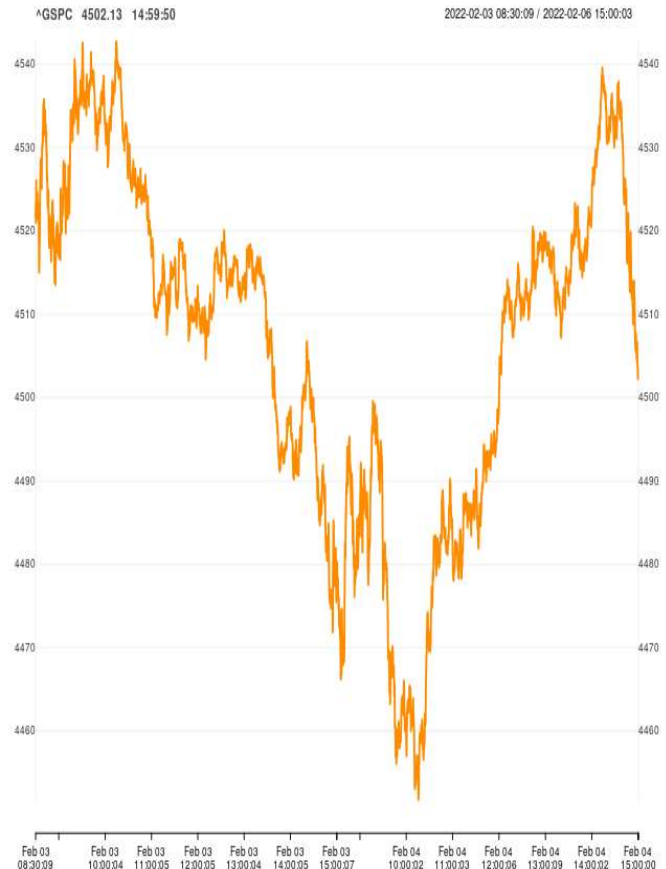
Fig. 1. Intraday Market Monitoring Example

Moreover, the ‘real-time’ symbol for the main market index is available only during (New York Stock Exchange) market hours. Yet sometimes one wants to gauge a market reaction or ‘mood’ at off-market hours.