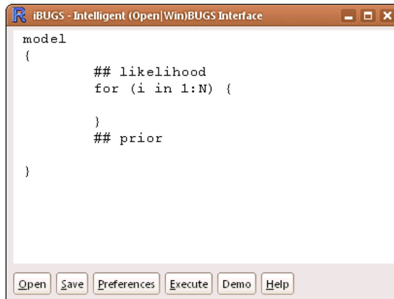
Figure 1: The main interface of iBUGS