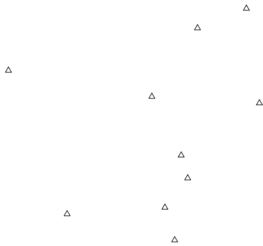
Figure 1: plot of SpatialPoints object; aspect ratio of x and y axis units is 1